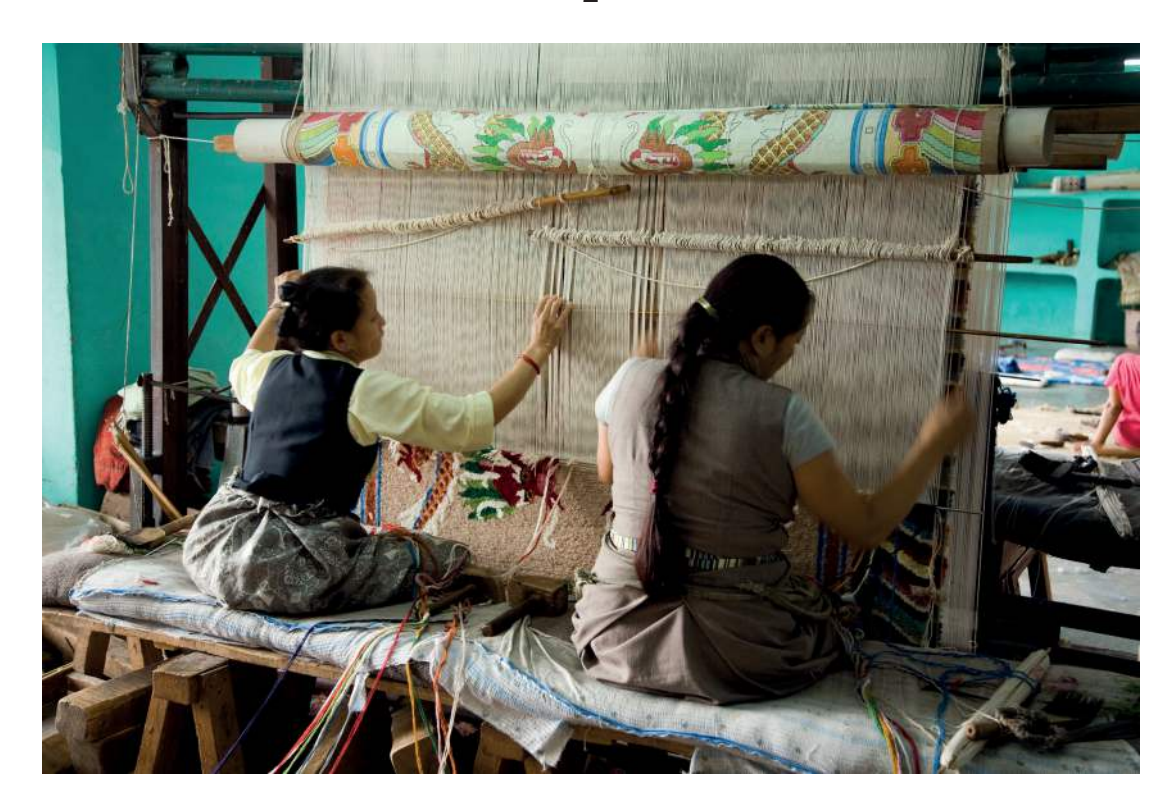
Photograph A for Question 3(a).